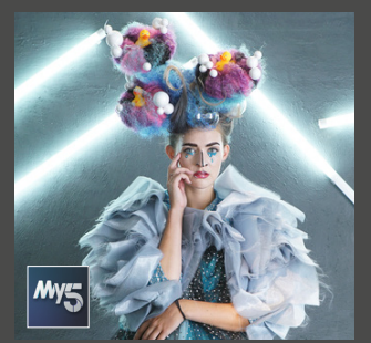
EXTREME HAIR WARS