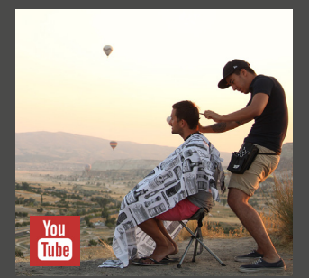
THE NOMAD BARBER