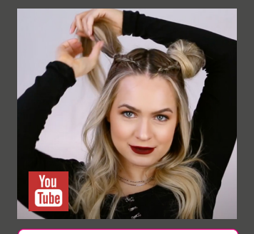
6 FESTIVAL HAIRSTYLES

Watch one (or more!) of the links below which will introduce to the exciting world of hairdressing: Available on Youtube, My5 or myhairdressers.com.